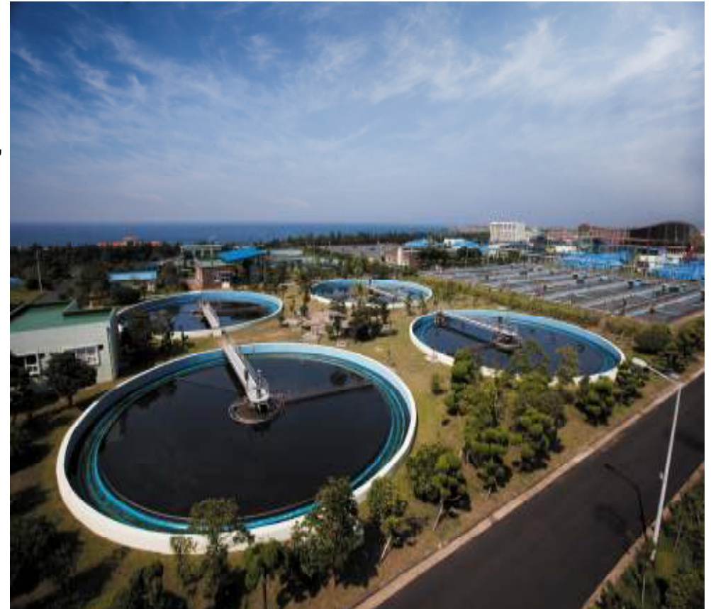
<Jeju, Waste Water Treatment Plant Project >